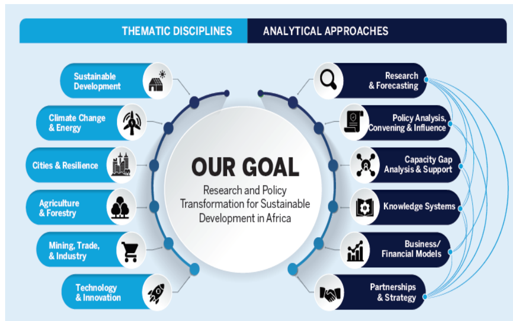
Figure 1: Thematic areas and the crosscutting analytical approaches